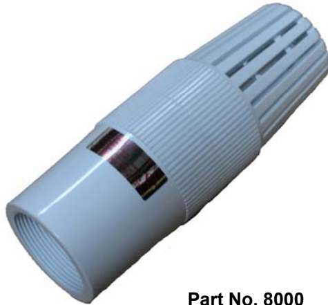
Part No. 8000